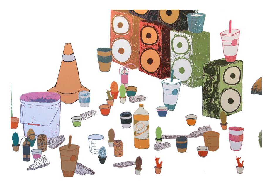
IMAGE CREDITS: Two Monuments detail, site specific installation, screen-print on paper pasted on wall, 2013; Hostage, screen-print, 13"x10", 2012

For more information about the artist please visit: www.andrewkozlowski.com.